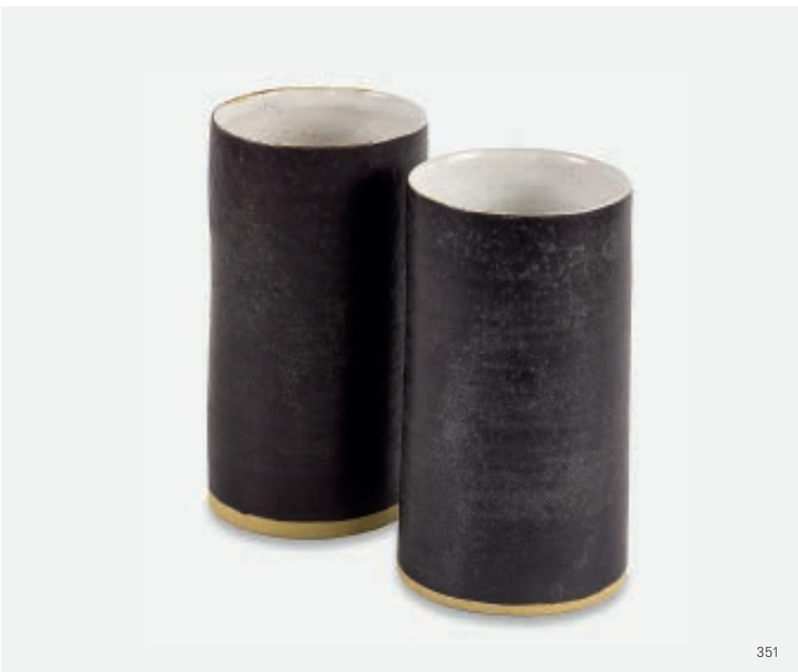
351 Lucie Rie A pair of stoneware beakers with manganese glaze exterior and white tin glazed interior. LR seal mark to the base of each. H.110mm $1800 – $2600