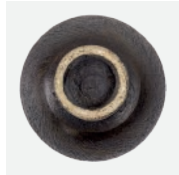
350 Hans Coper Digswell form Stoneware with black manganese glaze. Impressed with the artist's seal. H.140mm $6000 – $12000