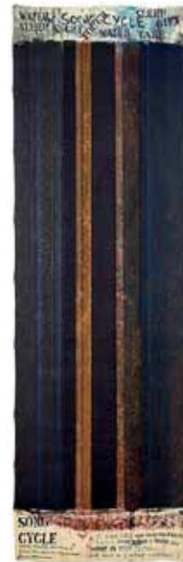
Ralph Hotere The Wind II acrylic and dyes on canvas, 1975 $170 000

A new record price for the artist at auction