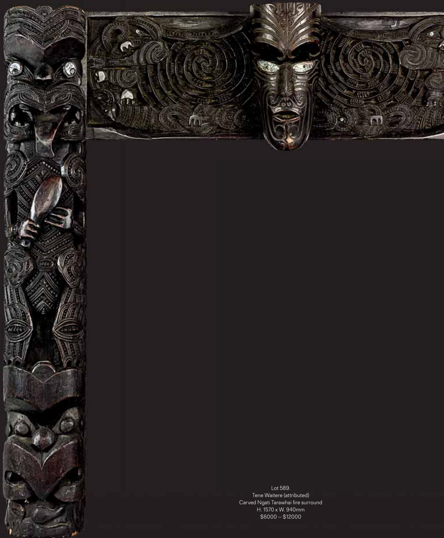
Lot 589. Tene Waitere (attributed) Carved Ngati Tarawhai fire surround H. 1570 x W. 940mm $6000 – $12000