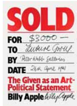
Billy Apple Sold acrylic on canvas $58 625

A new record price for the artist at auction