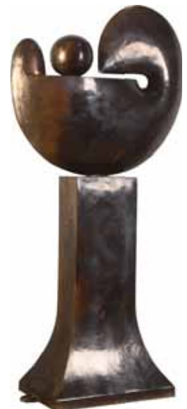
Paul Dibble Soft Geometric Series 2, No.1 cast bronze, edition of 2, 2004 $58 625