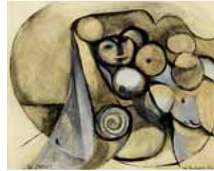
Colin McCahon Homage to Ingres gouache and ink and wash on paper, 1954 $87 935