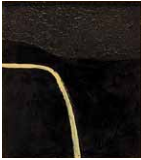
Colin McCahon Waterfall enamel and sawdust on board, 1964 $51 590