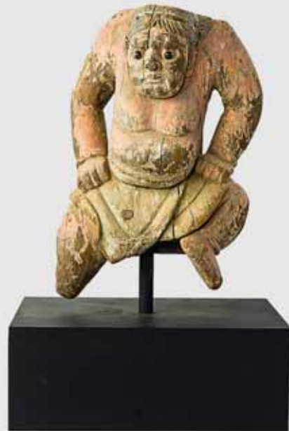
Large Chinese polychrome wood carving of a performer, Ming Dynasty (1368 – 1644). H. 430mm $2000 – $4000