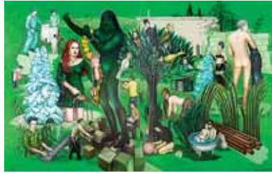
Seraphine Pick Hideout oil on linen, diptych, 2006 $58 625