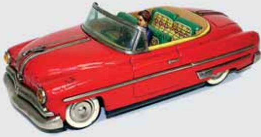
1953 Pontiac Convertible, Ichiko Brand (Japanese), tinplate toy complete with driver figure, L.360mm $700 – $1200