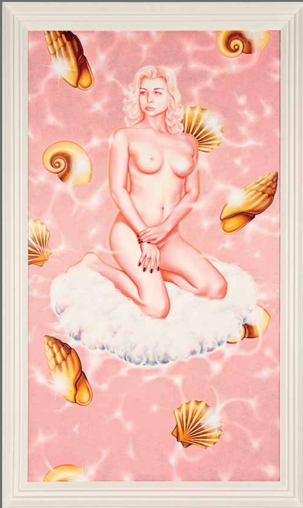
Liz Maw, Colleen , oil on board (2005), 2320 x 1300mm $35 000 - $50 000