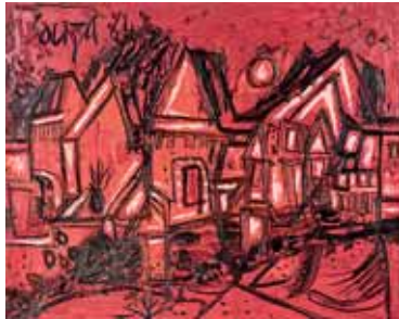
Francis Newton Souza Hampstead Terraces oil on board, 1964 $84 420