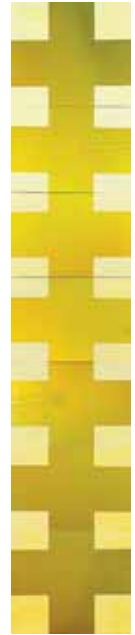
Stephen Bambury It Recalled the Immateriality of the Universe acrylic and resin on seven aluminium panels, 1999 $44 555