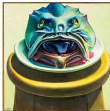
Michael Smither Hapuka oil on board, 1979 $75 040