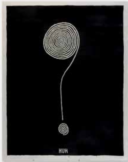
Peter Robinson Huh acrylic and oilstick on unstretched canvas, 1997 $35 175