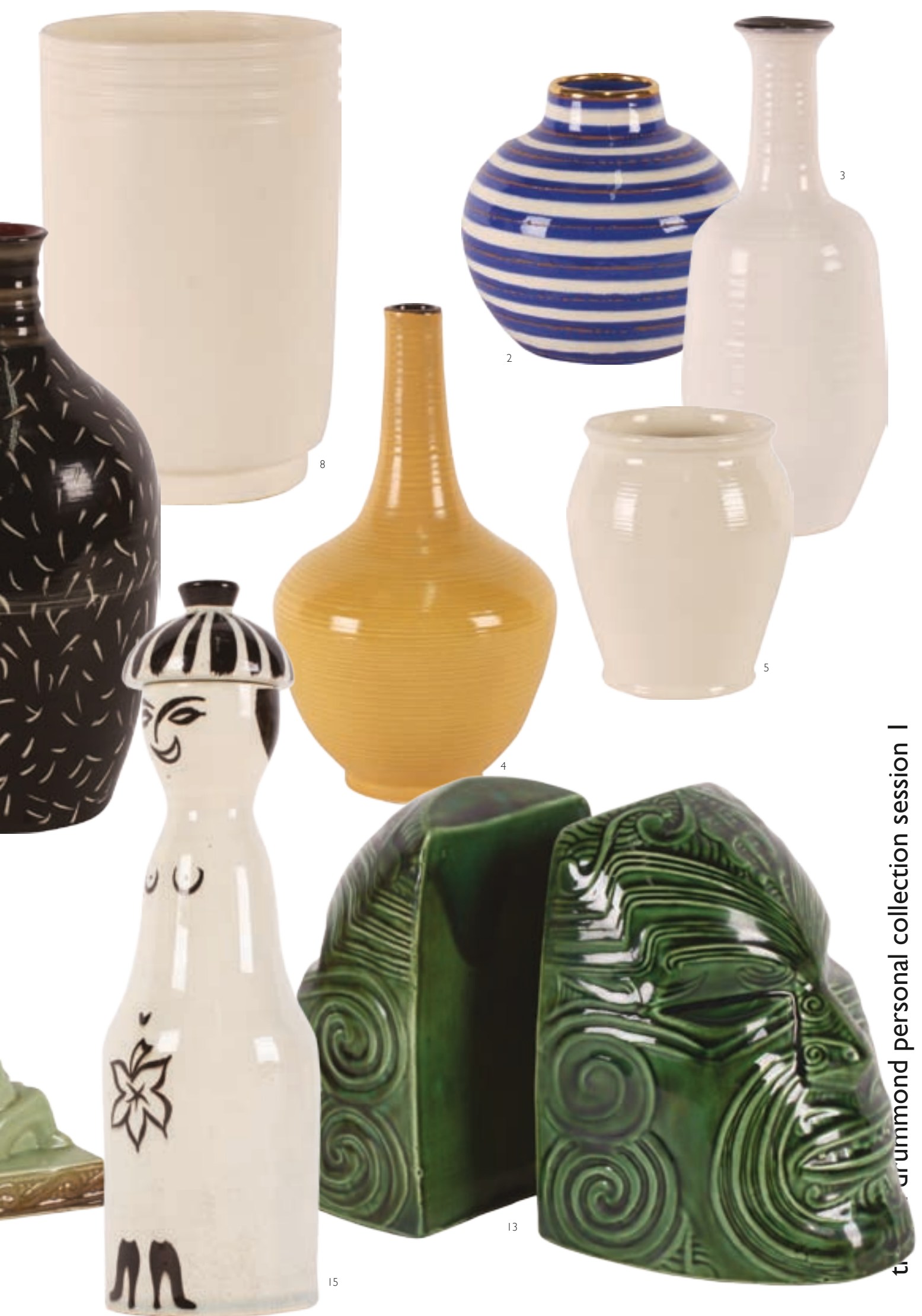
the grummond personal collection session 1